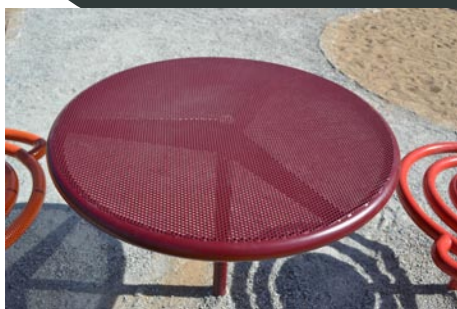
200 colours of the RAL range of colours